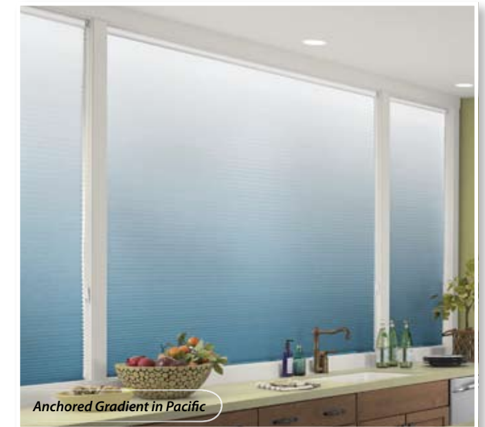
Anchored Gradient in Pacific

Floating Gradient A solid color on the top of the shade gently fading to white.