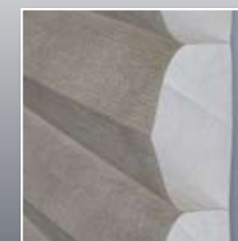
New 3/4" Tru-Cell™