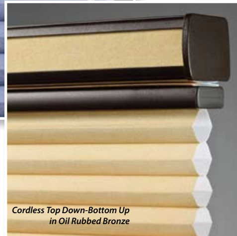
Cordless Top Down-Bottom Up in Oil Rubbed Bronze