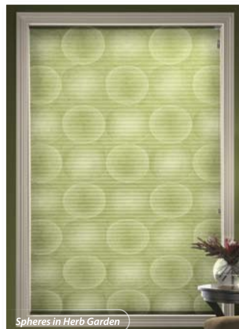
Spheres in Herb Garden

Anchored Gradient A white shade evolves into a bold color statement at the bottom of the shade.