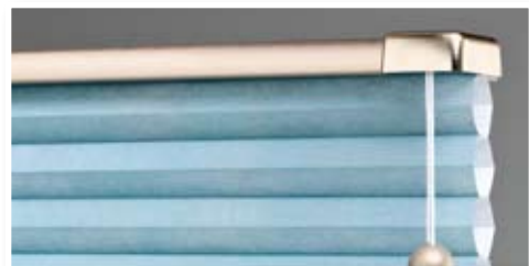
Standard Rectangular in Brushed Nickel