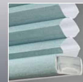
Fabric Wrapped Rails option