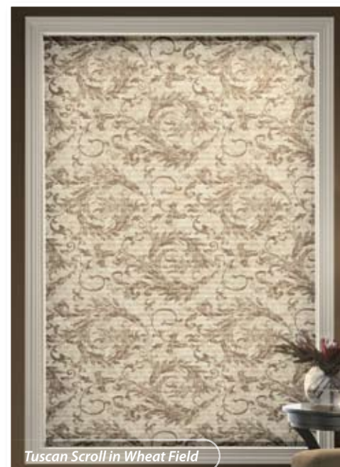
Tuscan Scroll in Wheat Field