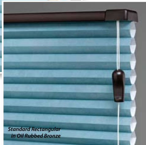
Standard Rectangular in Oil Rubbed Bronze