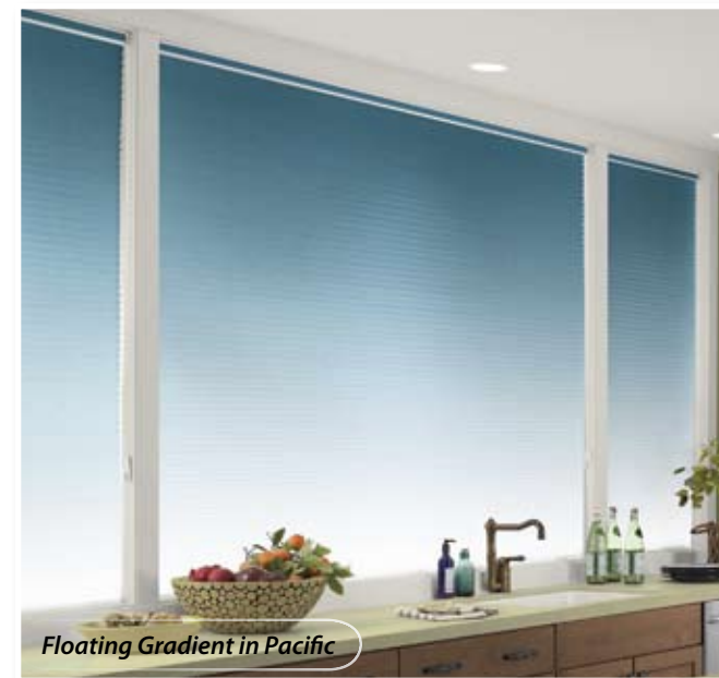
Floating Gradient in Pacific

Floating Gradient A solid color on the top of the shade gently fading to white.