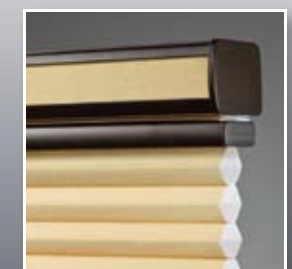
Designer Metallic Hardware option