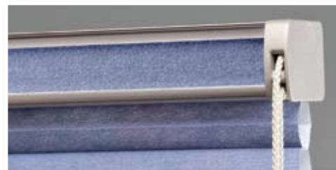
Smoothy in Brushed Nickel